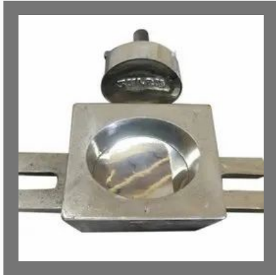
Manual Soap Die