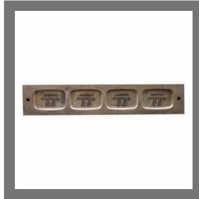
4 Cavity Soap Die