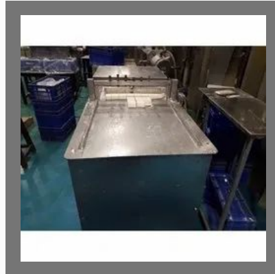
Soap Bar Cutting Machine