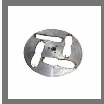
VME Stainless Steel Soap Mould