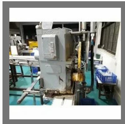
Mild Steel Soap Stamping Machine