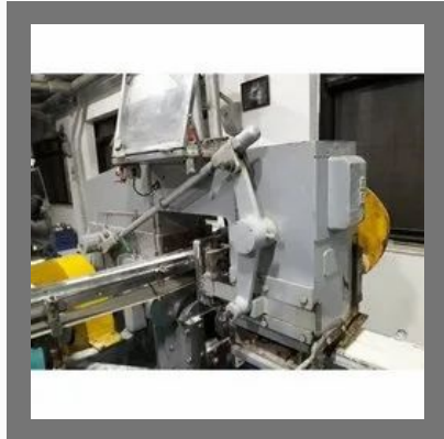
VME Soap Stamping Machine