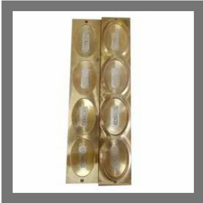
4 Cavity Soap Mould