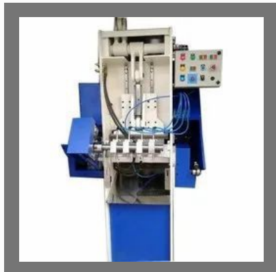
Automatic Soap Stamping Machine