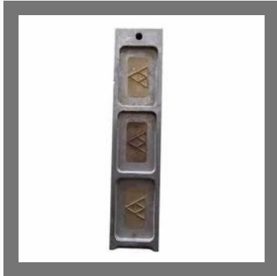
3 Cavity Soap Die