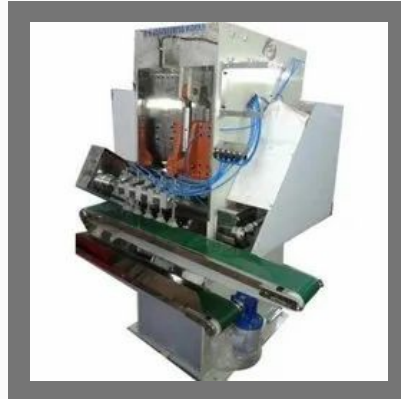
Electric Soap Stamping Machine