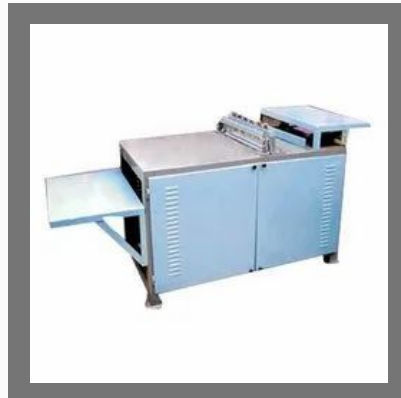
Automatic Soap Cutting Machine