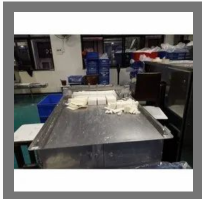
Soap Billet Cutting Machine