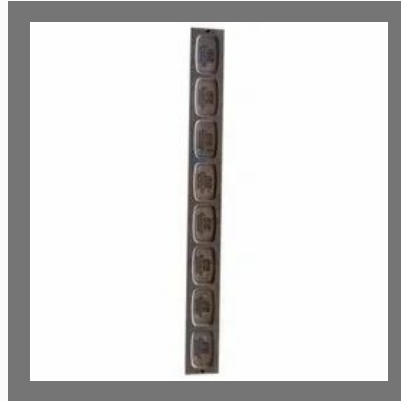
8 Cavity Soap Mould