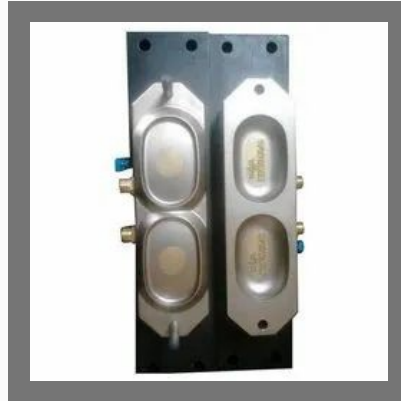
4 Cavity Brass Soap Mould