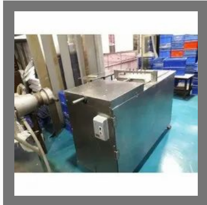
Electric Soap Cutting Machine