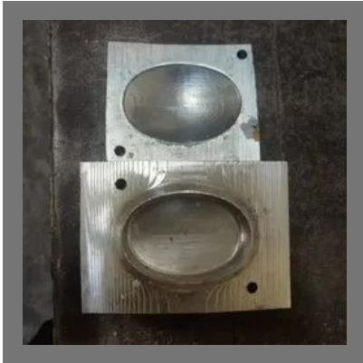
Bendless Soap Mould